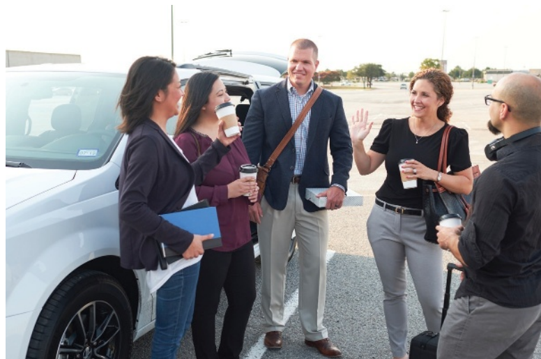
Riders save time and money, as well as reduce commuting stress, by forming a vanpool.

At Enterprise Holdings, vanpool programs are operated through the Enterprise Rideshare division, which takes more than 100,000 individual cars off the road every business day—eliminating more than 2.4 billion commuter miles driven each year. 4 As a result, Enterprise Holdings strongly believes that local vanpooling