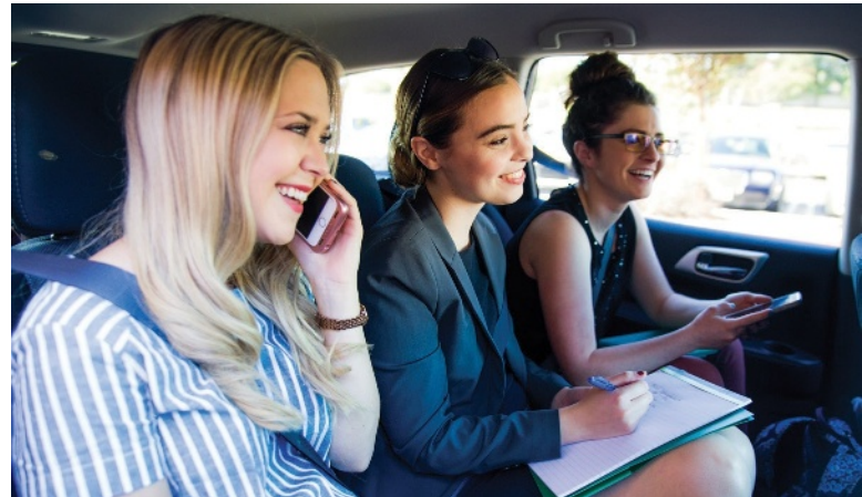
By taking turns driving, the average vanpool passenger gets nearly two hours of each day back to read, email, nap, shop, talk, or watch TV while commuting.